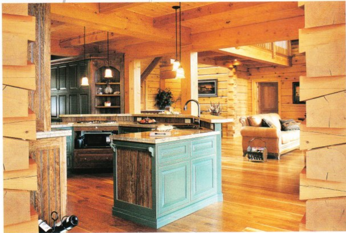
RIGHT